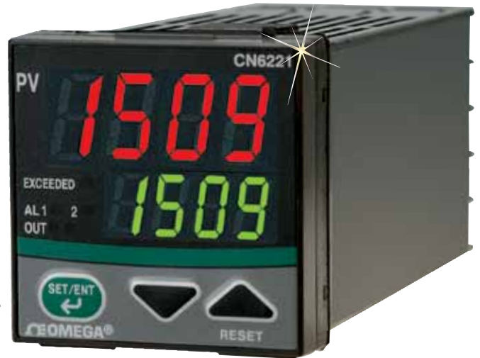
CN6221-R shown smaller than actual size.

Power Supply Voltage: 100 to 240 Vac ( \pm 10\% ), Frequency: 50 or 60 Hz Maximum Power Consumption: 8 Va max (4 W maximum) Memory: Non-volatile memory Withstanding Voltage (Between Primary and Secondary Terminals): 1500 Vac for 1 min (see Note 1) Insulation Resistance (Between Primary and Secondary Terminals): 20 M \Omega or more at 500 Vdc (see Note 1) Note 1: The primary terminals are the power supply terminals and relay output terminals. The secondary terminals are the analog input and output terminals, the voltage pulse output terminals, and the contact input terminals. Contact Input Function: Resetting "exceeded status" Input: 1 point Type: Non-voltage contact or transistor contact Contact Capacity: At least 12V/10 mA On/Off Judgment: On state for 1 k \Omega or less; off state for 20 k \Omega or greater