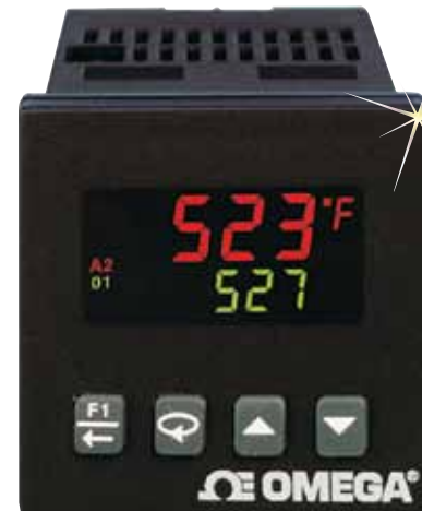
CN63200-R1 shown actual size.