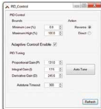
PID setup screen.

A comprehensive set of alarm functions may be used to trigger output signals and/or modify the display colors for above, below, in-band and out-of-band conditions. Physical outputs may be assigned to Alarm, PID, ON-OFF control or auxiliary output functions.