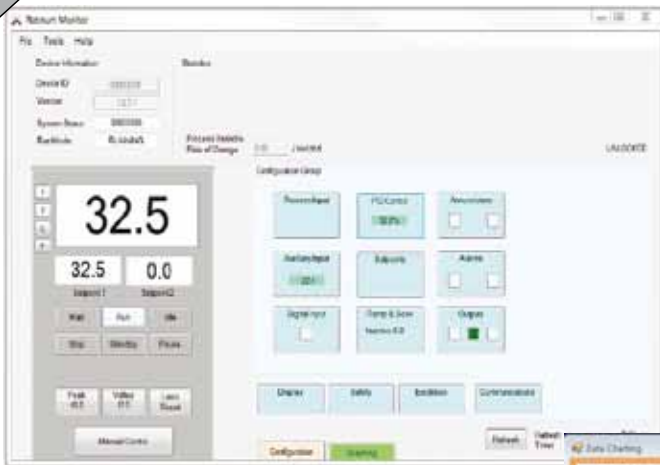
PLATINUM monitor front panel.