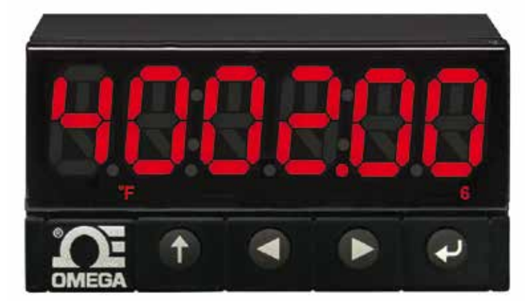
CN8EPt Series shown actual size.