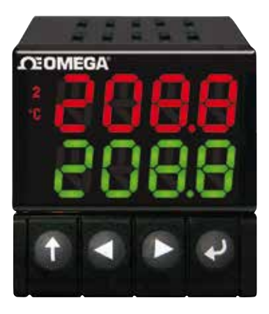
CN16DPt Series shown actual size.