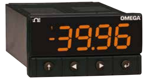
CN32Pt Series shown actual size.