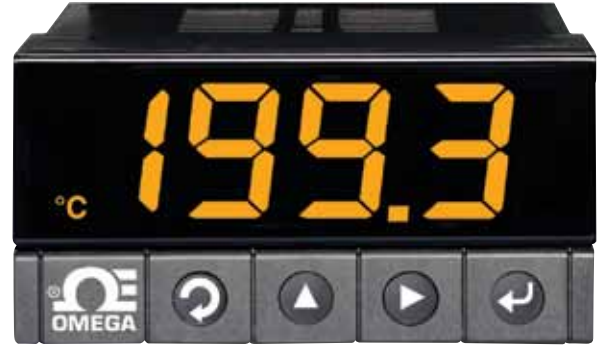
DPi8, shown smaller than actual size.