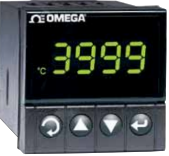
DPi16, shown smaller than actual size.