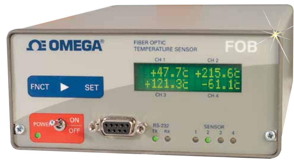
FOB102 shown actual size.