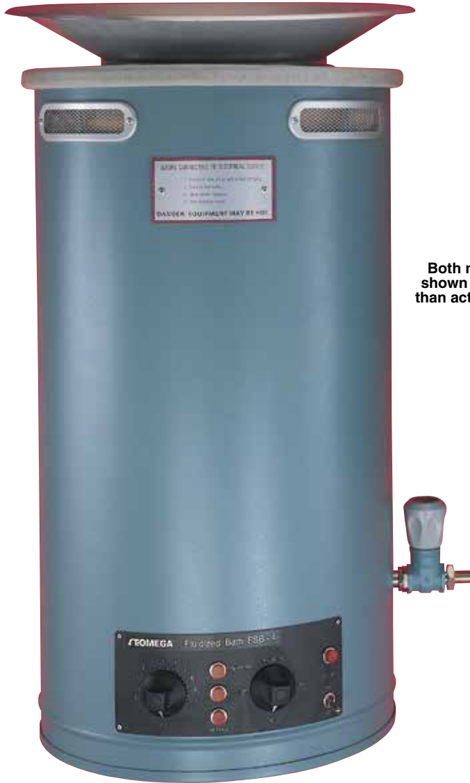
FSB-4 130 lb capacity