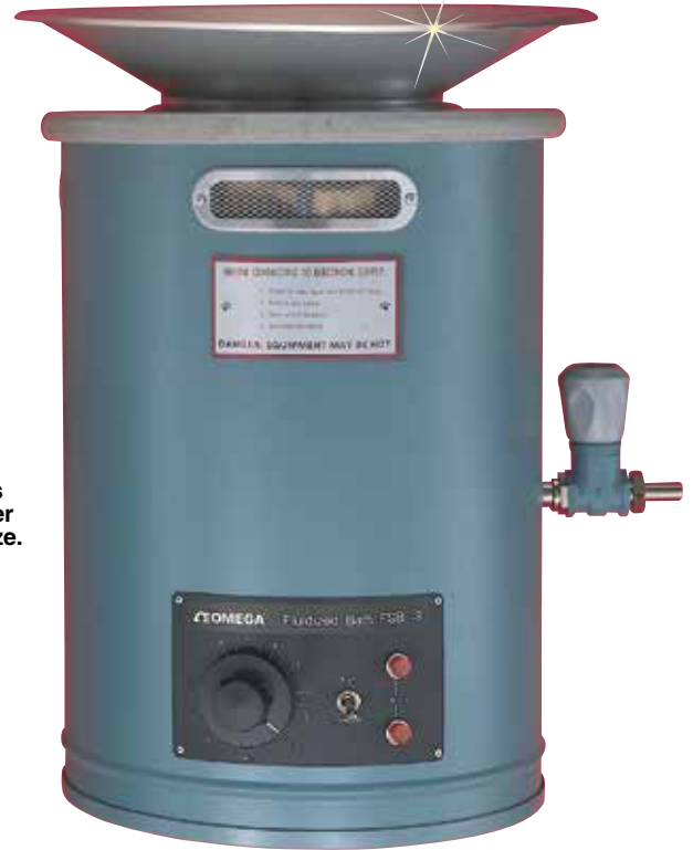
FSB-3 51 lb capacity

Both models shown smaller than actual size.