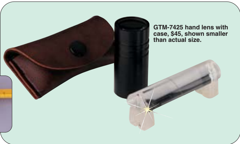
GTM-7425 hand lens with case, $45, shown smaller than actual size.