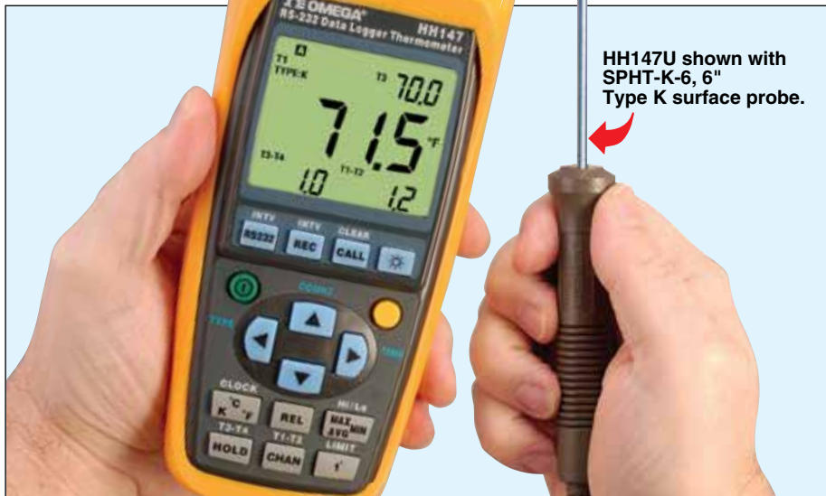
HH147U shown with SPHT-K-6, 6" Type K surface probe.

The OMEGA® HH147U is a rugged, easy-to-use thermometer with 4 standard miniature connector inputs. It accepts 7 different thermocouple types and displays all 4 inputs at the same time. It also provides differential temperature measurement readings of T3-T4, as well as individual readings of the 4 inputs. Other features are a low battery indicator, perpetual calendar, and auto power-off.