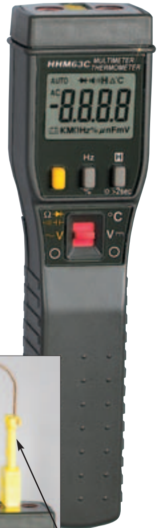
HHM63C/HHM63F Multimeter Thermometer 2500 count resolution W/microprocessor-based DMM DCV accuracy: 0.25% Resistance accuracy: 0.3% Backlit LCD display Frequency accuracy up to \pm 0.05\% Frequency resolution up to 0.001 Hz Type K input Temp. accuracy \pm 2\%