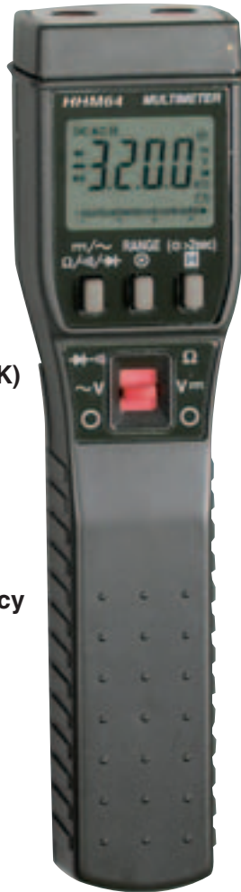
HHM64 Stick Type Multimeter 3200 count resolution Analog bargraph function Backlit LCD display DCV accuracy: 0.25%