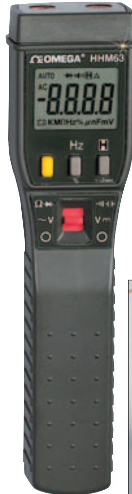
HHM63 Stick Type Multimeter 2500 count resolution W/Microprocessor-Based DMM DCV Accuracy: 0.25% Resistance accuracy: 0.3% Backlit LCD display Frequency accuracy up to \pm 0.05\% Frequency resolution up to 0.001 Hz