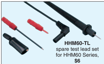
HHM60-TL spare test lead set for HHM60 Series, $6