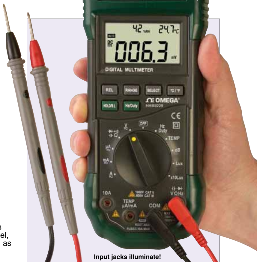
Input jacks illuminate!

Temperature (Type K Thermocouple): -20 to 0°C \pm 5.0\% \text{ rdg} ; 0 to 400°C \pm 1.0\% \text{ rdg} ; 400 to 1000°C \pm 2.0\% \text{ rdg} ; 4 to 32°F \pm 5.0\% \text{ rdg} ; 32 to 752°F \pm 1.0\% \text{ rdg} ; 752 to 1832°F \pm 2.0\% \text{ rdg}