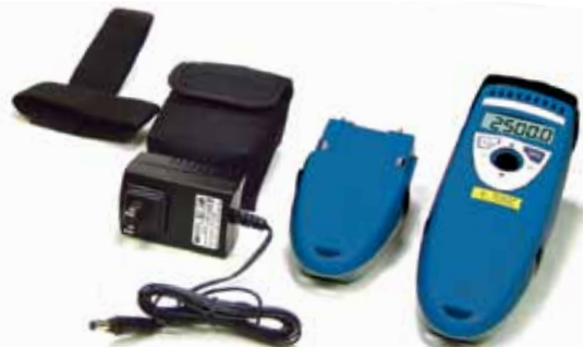
HHT41B-PAK includes strobe, 2 batteries, 115 Vac charger and holster.

Ordering Example: HHT41B-KIT, stroboscope with universal charger, 1 rechargeable battery pack, 2 spare lamps, NIST certificate and carrying case. OCW-3, OMEGACARE SM extends standard 1-year warranty to a total of 4 years.