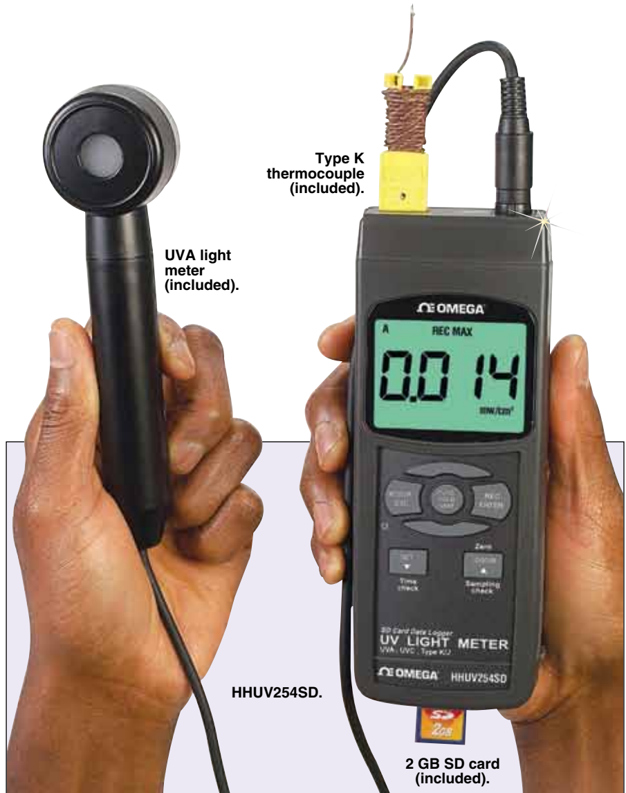
UVA light meter (included).

Many industrial and commercial applications require or can benefit from measurement of the intensity of UVA and/or UVC light. Among them are welding (to minimize exposure to "blue light" radiation), UV sterilization of food, photochemical matching, erasure of electrically programmable read-only memory (EEPROM) chips, production of graphic arts products, exposure of photoresists, and curing of inks, adhesives and coatings.