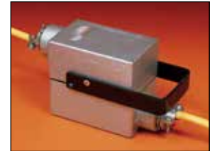
Wire and cable clamp (JB-CC) sold separately.

Optional supply of standard size SPJ-CAP-12 package of 12 Wire and cable clamp (JB-CC) sold separately.