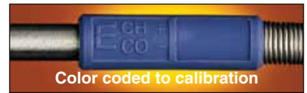
Color coded to calibration

Thermocouple molded assemblies with transition joints of molded LCP high temperature liquid crystal polymer provide an economical yet durable thermocouple probe for a variety of sensing applications. The measuring tip is limited only by thermocouple type and sheath material. Stainless steel sheaths have a maximum temperature of 900°C (1650°F) with Inconel 600 rated to 1150°C (2100°F). The calibration letter code is an integral part of the mold.