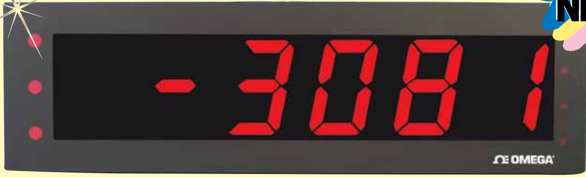
LDP63100-E shown smaller than actual size.