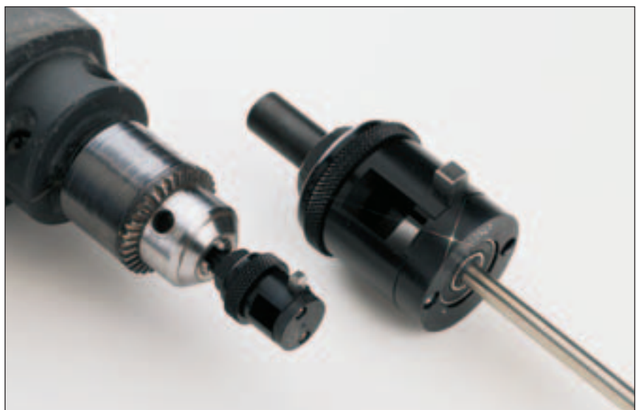
Thermocouple Wire Stripper for OMEGA CLAD® wire. See PST Series Strippers in Section H.

Temperature limitations: up to 1,177°C (2,150°F)