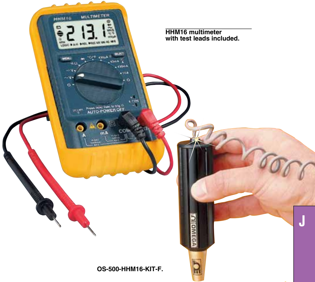
HHM16 multimeter with test leads included.

OMEGACARE SM extended warranty program is available for models shown on this page. Ask your sales representative for full details when placing an order. OMEGACARE SM covers parts, labor and equivalent loaners.