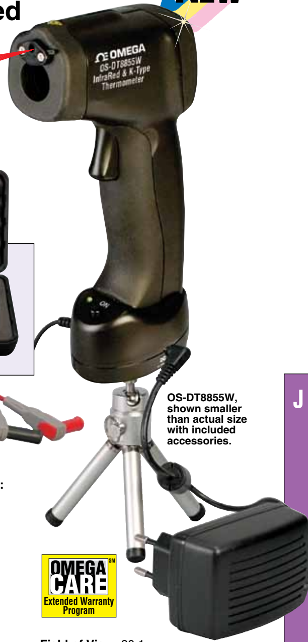
OS-DT8855W, shown smaller than actual size with included accessories.

The high performance, handheld OS-DT8855W infrared thermometer is a non-contact temperature measurement instrument that features a laser circle/dot sight. The patented laser sighting system defines the target for point and shoot measurement of temperatures from -50 to 1050°C (-58 to 1922°F) and reads surface temperature in less than a second.