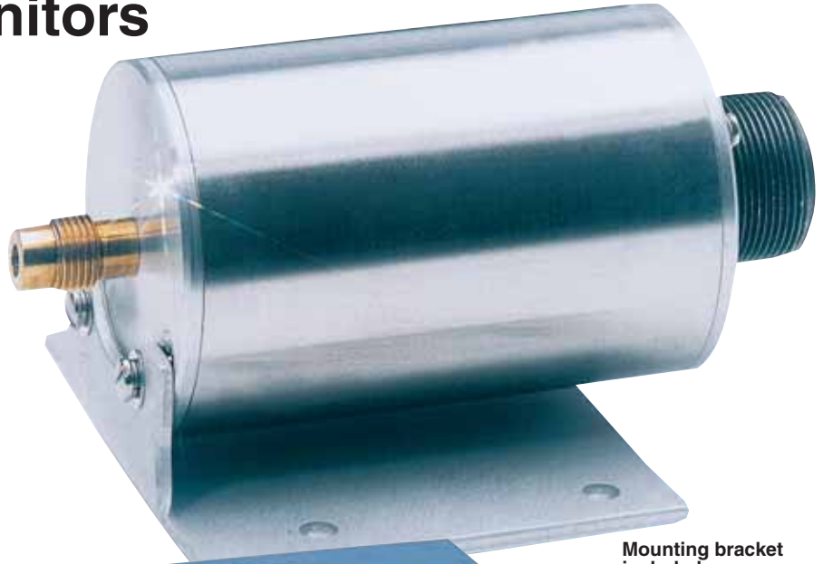
Mounting bracket included.