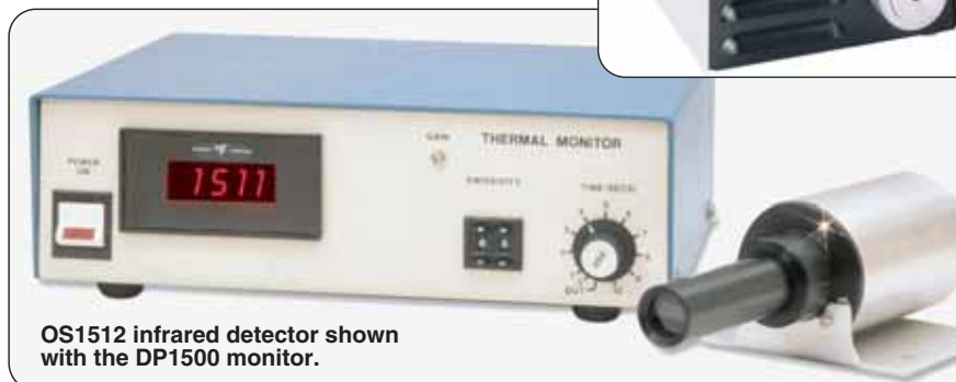
OS1512 infrared detector shown with the DP1500 monitor.