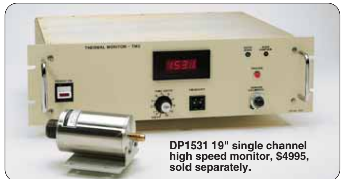
DP1531 19" single channel high speed monitor, $4995, sold separately.

OMEGACARE SM extended warranty program is available for models shown on this page. Ask your sales representative for full details when placing an order. OMEGACARE SM covers parts, labor and equivalent loaners.