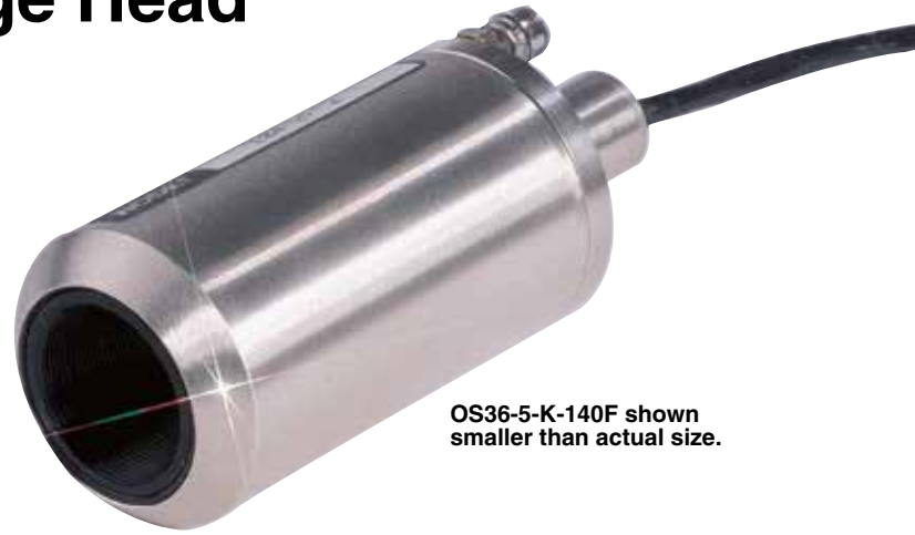
OS36-5-K-140F shown smaller than actual size.

The OS36-5 Series extends the range of applications for infrared thermocouple thermometry to situations in which the sensor is mounted remotely from the target. To the ruggedness and ease of use of the original OS36 Series, the new OS36-5 Series adds hermetic sealing and an internal air cool/purge system. This series exceeds all applicable NEMA standards and is intrinsically safe when used with appropriate barriers.