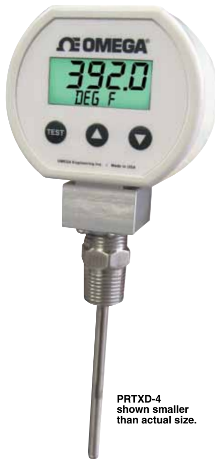
PRTXD-4 shown smaller than actual size.

The PRTXD Series are 2-wire transmitters that provide a 4 to 20 mA signal representing temperature. The units include a 4½ digit display and the RTD sensor. The NEMA 4X (IP66) housing protects the electronics. Units are available with spring-loaded probes for use with thermowells.