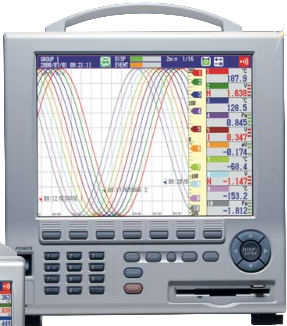
RD-MV210-1, $4454, shown smaller than actual size.