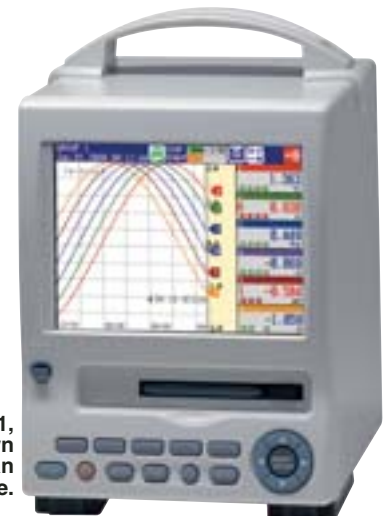
RD-MV106-1, $2784, shown smaller than actual size.

Desktop (file transfers, configurations, etc., using operations on desktop); data monitoring; hardware configurations (online or using a removable storage medium; data viewer; printout of playback data; file conversion to ASCII, Lotus 1-2-3, and MS-Excel formats)