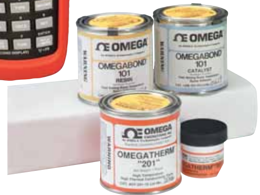
OMEGABOND®, Visit omega.com