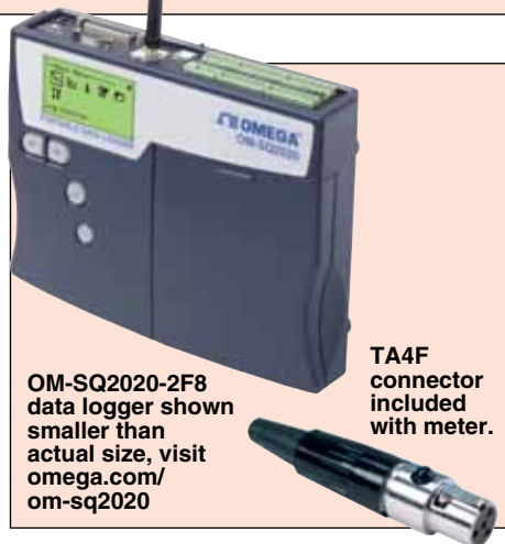
OM-SQ2020-2F8 data logger shown smaller than actual size, visit omega.com/om-sq2020

Make Your Sensor Into a Complete Measurement System!