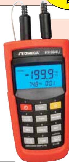
HH804U handheld, shown smaller than actual size, visit omega.com/hh804_805