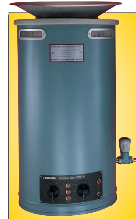
FSB-4, 130 lb-capacity fluidized sand bath temperature probe calibrator.

The thermoelectric cooling elements in an ice point calibration reference chamber produce a very precise, stable temperature of