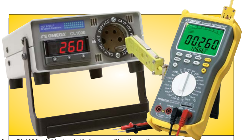
CL1000 mini hot point® shown calibrating a thermocouple probe, Model KTSS-HH, with the HMM290 handheld thermometer.

The block calibrator, used for temperature probes, contains a metal block that can be heated to precise temperatures. These temperatures are compared to those taken by temperature probes inserted into the block. Temperature probes generally cannot be adjusted, so this process is one of verification rather than true calibration.