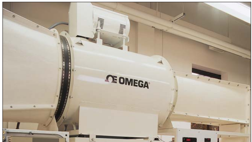
OMEGA's 5 H x 8 meter L (15' x 25') recirculating temperature-controlled wind tunnel is used in conjunction with NIST-traceable air velocity standards to provide accurate flow calibrations.