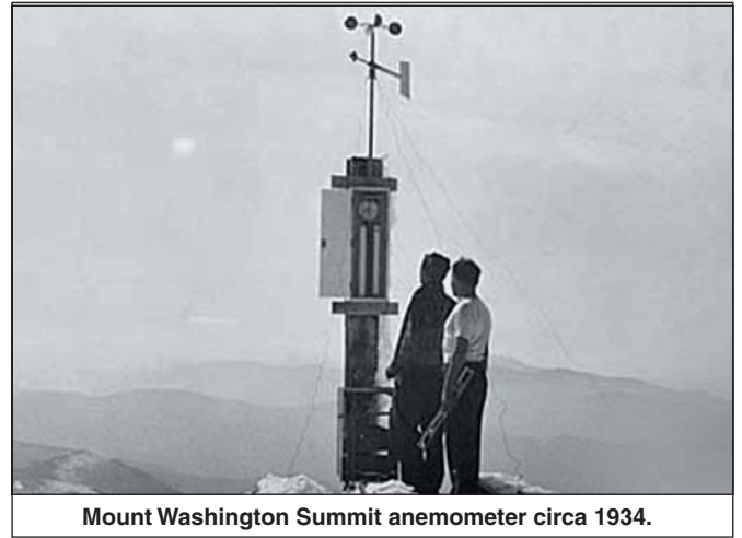
Mount Washington Summit anemometer circa 1934.

On April 12, 1934, an anemometer on the summit of Mount Washington in New Hampshire measured the highest surface wind speed ever recorded: 231 miles per hour. The Mount Washington anemometer, which had been calibrated in 1933, was recalibrated after the world record measurement, and it proved to be accurate. When a typhoon hit Guam in December of 1997, the record seemed to be broken—an anemometer at an American air force base recorded a wind gust of 236 mph. That reading, however, did not stand because the National Climate Extremes Committee judged the Guam anemometer unreliable. To metrology experts, the survival of the old record was an object lesson in the importance of calibration. A footnote: wind speeds greater than 231 mph are believed to have occurred in tornadoes, but no documentation device has yet withstood such extremes. Contrary to rumor, the Mount Washington anemometer did not blow away during the 1934 storm. Today, it resides in the mountain's Observatory Summit Museum.