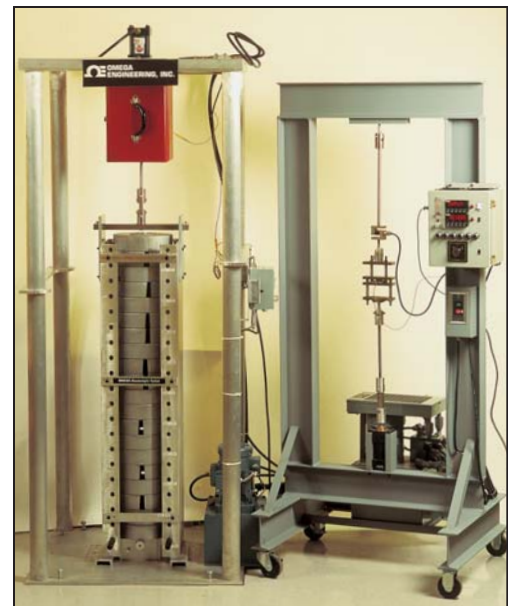
High-capacity deadweight tester (left) and hydraulic tester (right) used in the calibration of load cells and strain gages.