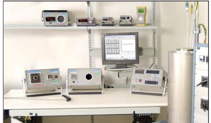
In OMEGA’s calibration laboratory, NIST-traceable precision instruments are used to perform accurate temperature calibrations.

The calibration of the vessel requires hangers or shelves to support the calibration weights. For an ASME vessel, they must be added when the vessel is fabricated. Calibration to an accuracy of 0.25% full scale or better is usually performed with dead weights and is the only calibration method recognized by weights and measures agencies.