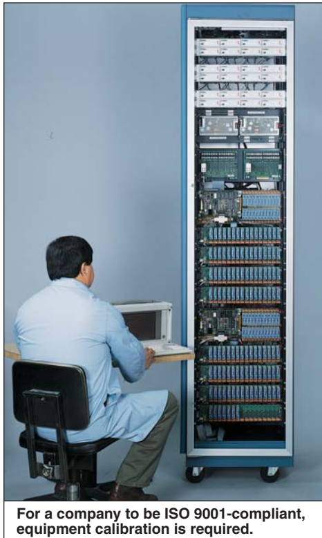
For a company to be ISO 9001-compliant, equipment calibration is required.

technology would ever need to be calibrated. The answer is that virtually all equipment degrades in some fashion over time, and electronic equipment—a mainstay of the manufacturing process—is no exception. As components age, they lose stability and drift from their published specs. Even normal handling can adversely affect calibration, and rough handling, of course, can throw a piece of equipment completely out of whack (though it may appear perfectly fine).