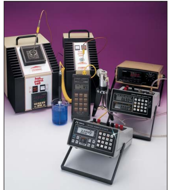
OMEGA® offers a full line of calibration devices.

Typically, the accuracy of a calibration device, or calibrator, is at least four times greater than the equipment being calibrated. The equipment usually has a calibration range over which the technician will, at various points, check specifications. As Mike Cable explains in Calibration: A Technician's Guide , "the calibration range is defined as 'the region between the limits within which a quantity is measured, received or transmitted, expressed by stating the lower and upper range values.' The limits are defined by zero and span values. The zero value is the lower end of the range. Span is defined as the algebraic difference between the upper and lower range values."