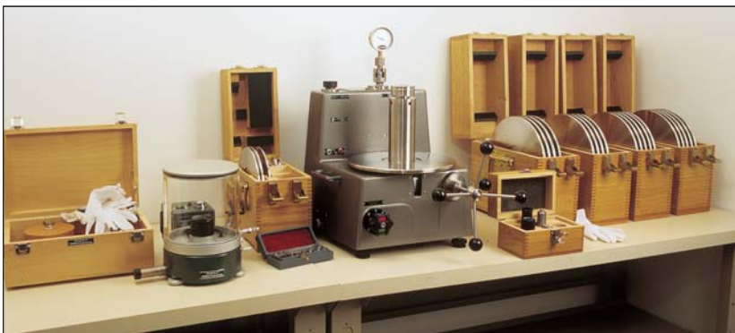
NIST-traceable low pressure and high pressure deadweight testers.