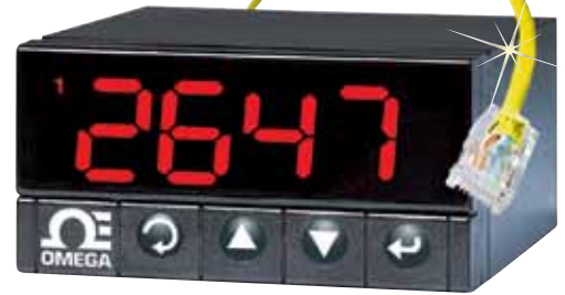
Shown smaller than actual size.

The CNi8 covers a broad selection of transducer and transmitter inputs with 2 input models.